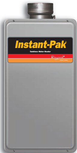
INDOOR DIRECT VENT